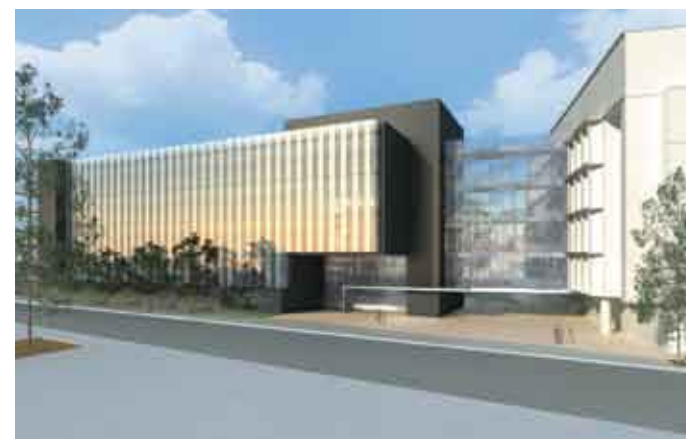
THE INVESTMENT OF $27 MILLION FROM CIRM AND $116 MILLION FROM DONORS AND USC WILL CREATE A SCIENTIFIC CROSSROADS OF BASIC AND CLINICAL SCIENCE.

The University of Southern California is constructing a five-story building on its campus to house the Eli and Edythe Broad Center for Regenerative Medicine and Stem Cell Research at USC. CIRM awarded $26.9 million to the Keck School of Medicine to construct the building.