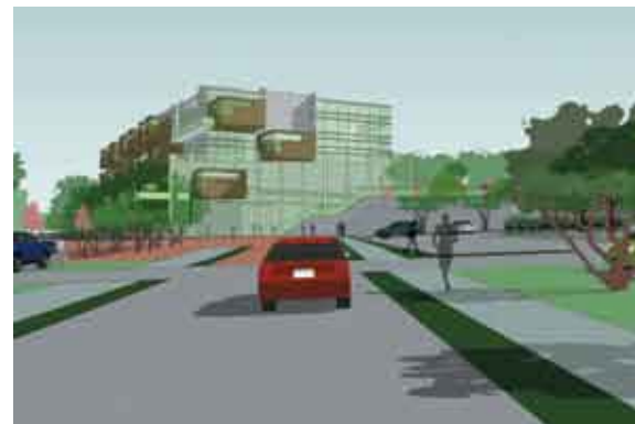
THE INVESTMENT OF $43 MILLION FROM CIRM AND $112 MILLION FROM DONORS AND INSTITUTIONS WILL BRING DIVERSE SCIENTISTS TOGETHER TO DEVELOP NEW TREATMENTS FOR DISEASE.

The balance of the construction costs will be raised by members of the consortium, which includes UCSD, The Scripps Research Institute, the Salk Institute for Biological Studies and the Burnham Institute for Medical Research.