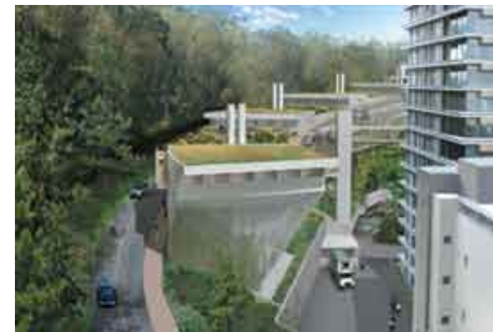
THE INVESTMENT OF $35 MILLION FROM CIRM AND $100 MILLION FROM DONORS AND UCSF WILL UNITE SCIENTISTS FROM DIFFERENT FIELDS TRYING TO SOLVE SIMILAR PROBLEMS.

The researchers at the University of California, Los