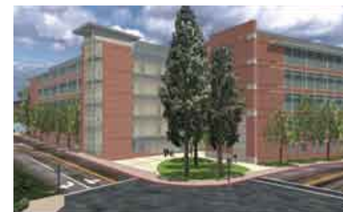
THE INVESTMENT OF $20 MILLION FROM CIRM AND $63 MILLION FROM DONORS AND UCLA WILL LEAD TO NEW THERAPIES FOR MANY DISEASES INCLUDING CANCER.

The University of California, Los Angeles received $19.8 million from CIRM to build new facilities to house the Eli and Edythe Broad Center of Regenerative Medicine and Stem Cell Research at UCLA. The university is contributing $22.9 million toward construction.