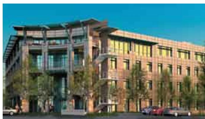
THE INVESTMENT OF $27 MILLION FROM CIRM AND $55 MILLION FROM DONORS AND UCI WILL ALLOW BASIC RESEARCHERS AND THEIR CLINICAL COLLEAGUES TO WORK TOGETHER TOWARD CURES.

Investigators funded by these grants receive salary and research support for five years, creating a stable environment for building innovative research programs at a point in their careers when funding can be difficult to obtain.