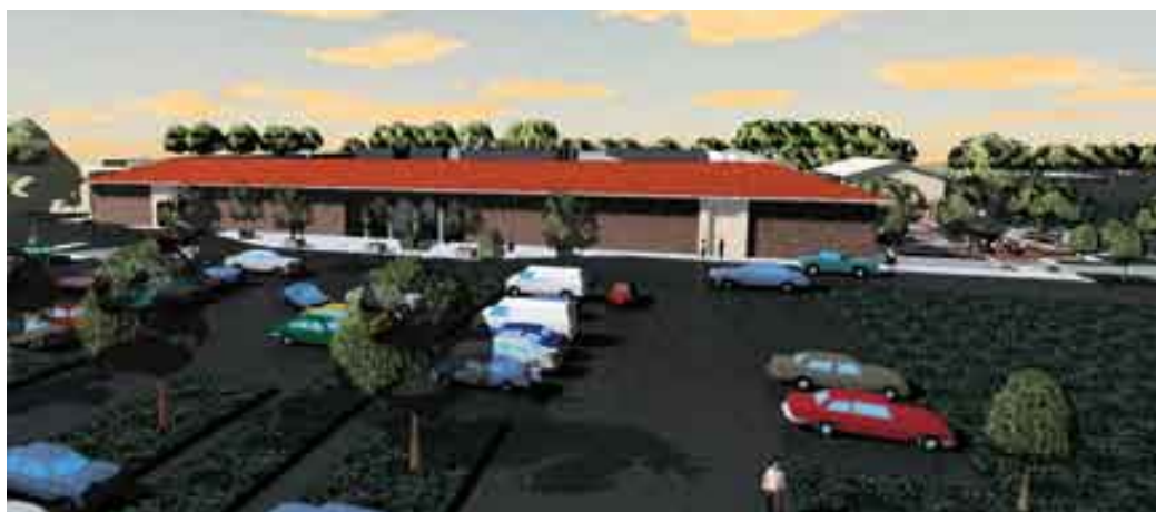
THE INVESTMENT OF $20 MILLION FROM CIRM AND $79 MILLION FROM DONORS AND UCD WILL CREATE A COLLABORATIVE STEM CELL RESEARCH HUB.

A $20 million grant from CIRM will create 90,000 square feet of research space. Matching funds will come from the university, as well as from individuals and foundation grants.